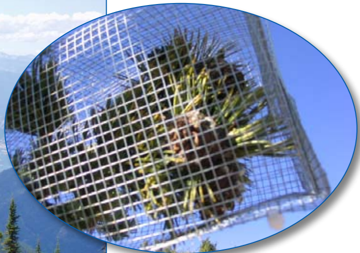
Installation of protective cone cages.