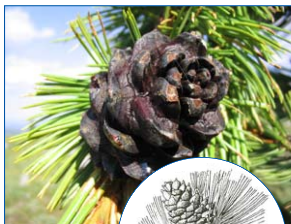
Whitebark pine cone.

Near tree-line on severe, exposed, wind-swept sites, whitebark pine is often a stunted, slow growing shrub. The multiple stems can be the result of several germinants arising from a seed cache deposited by a Clark's nutcracker or a squirrel, or the result of poor apical dominance. At lower elevations stems can be quite straight, attain commercial dimensions, and occasionally be confused with western white pine, or at a distance lodgepole pine. Trees over 1.46 m in diameter, and 31 m tall have been recorded. The wood quality is inferior to most other conifers for construction, decorative, and commercial purposes due to its poor live load bending strength, spiral grain, and generally low volumes.