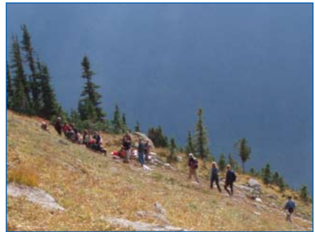
Volunteer planters at Whistler Mountain.

Both the Ministry of Environment and the Whistler Naturalists in cooperation with Intrawest, a company