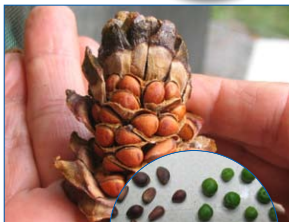
Cone scales broken with seeds exposed.